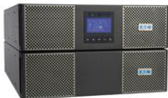
Eaton 9PX UPS with Extended Battery Module