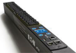
Eaton ePDU G3